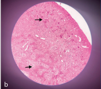
[Table/Fig-5]: a) Haematoxylin and eosin stained section exhibiting areas of ossification within connective tissue stroma (20x); b) Microscopic picture exhibiting areas of ossification and areas of dystrophic calcification within connective tissue stroma (10x).

Crocker in 1903 though some researchers believe that the term was coined by Hartzell in 1904 [1,2]. The lesion has been referred to as granuloma pediculatumbenignum, pregnancy tumour, vascular epulis, and Crocker and Hartzell's disease [3]. Since, it is associated with abundant blood vessel proliferation it was referred as hemangiomatous granuloma by Angelopoulos AP and Granuloma Telangietacticum by Cawson RA et al., [4].