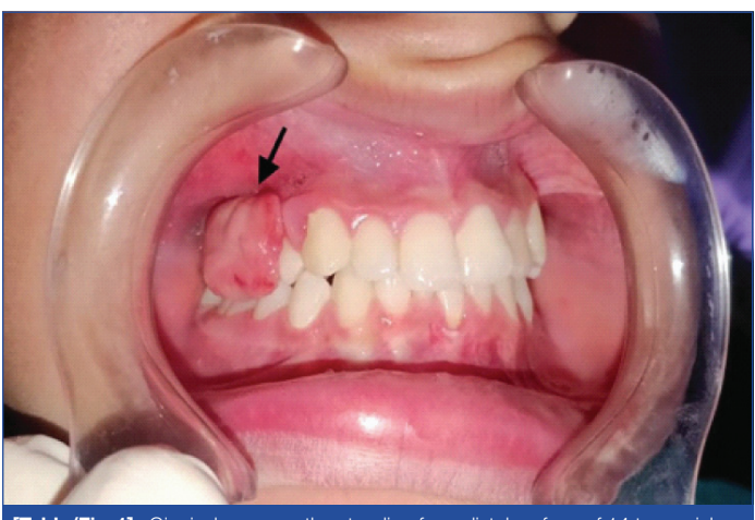
[Table/Fig-1]: Gingival overgrowth extending from distal surface of 14 to mesial surface of 16

A 12-year-old female patient, reported with a chief complaint of soft tissue overgrowth from the gums in the upper right back tooth region. The patient noticed the growth two months back. Though the growth was small initially, but it gradually increased to the present size. On clinical examination, it was found to be pedunculated, painless and was soft to firm in consistency. The growth measured around 2.0×1.5 cm in size extending from distal surface of 14 to mesial surface of 16 arising from interdental papilla [Table/Fig-1]. Periodontal evaluation did not reveal periodontal pockets but plaque was observed. There was no remarkable finding seen in the Intraoral Periapical Radiograph (IOPA). On the basis of clinical and radiographic examination a provisional diagnosis of pyogenic granuloma was made. Differential diagnosis included peripheral ossifying fibroma, peripheral giant cell granuloma, irritational fibroma as these lesions mimic each other clinically, but histopathology can confirm the diagnosis. Oral prophylaxis was performed followed by an excisional biopsy of the lesion which was carried out with scalpel followed by curettage and through scaling of the involved tooth. Excised tissue was sent to the Department of Oral Pathology for histopathological examination [Table/Fig-2].