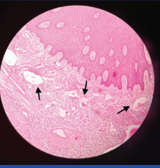
[Table/Fig-3]: Haematoxylin and Eosin stained microscopic picture exhibiting ulcerated epithelium and connective tissue stroma (20x); [Table/Fig-4]: Haematoxylin and eosin stained section exhibiting stratified squamous epithelium and connective tissue stroma showing numerous proliferating blood vessels and moderately dense chronic inflammatory cell infiltrate (20x) (Images from left to right).